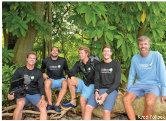
John John Florence (center) and his sailing crew at Palmyra Atoll.

Kākou includes not just our human community, but all the plants, birds, fish, and other living things we share Hawai‘i with. I am inspired by the way nature recovers when we give it a hand—just like we can support one another. Nature can